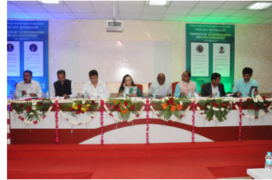
StartUp Yatra workshop in Gwalior with the commissioner and the smart City innovators