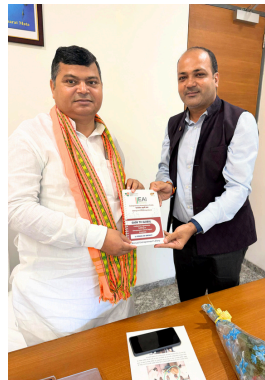
Meeting with Hon Union Minister of State for Jal Shakti, Govt. of India, Shri Raj Bhusan Choudhary