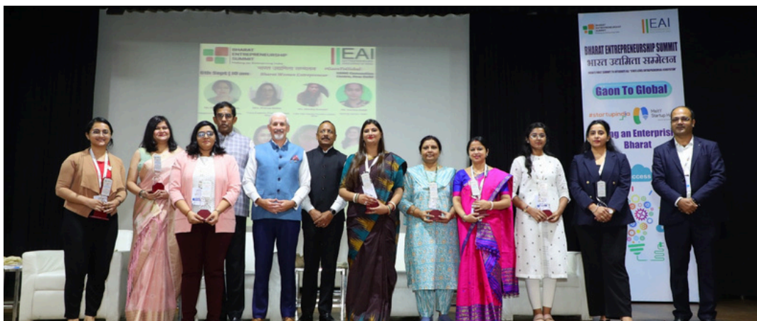
Women Entrepreneur from across India received the Bharat Entrepreneur Award at Bharat Entrepreneurship Summit, New Delhi