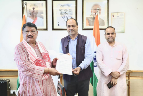
Meeting with Hon Union Minister of Tribal Affairs, Govt. of India, Shri Jual Oram Ji