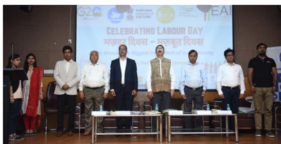
In 2023, at Delhi Public Library, Delhi as Majdoor Diwas- Maboot Diwas on Labour Day with Ministry of Culture, Govt of India