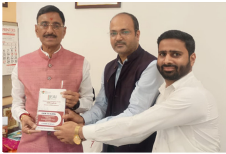
Meeting with Hon Union Minister of State for Defence, Govt. of India, Shri Sanjay Seth