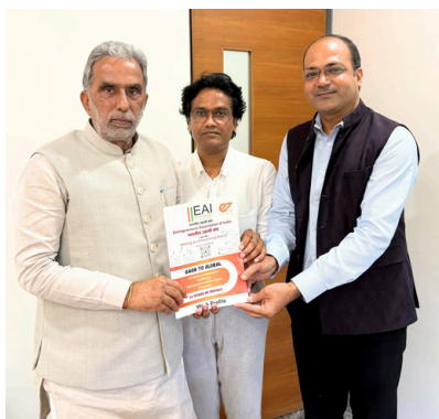
Meeting with Hon Union Minister of State of Cooperation, Govt. of India, Shri Krishan Pal Gurjar