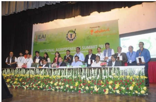
National Agripreneurship Summit, New Delhi with 700 Agripreneurs, Govt officials, Foreign Embassies, Investors, 2017