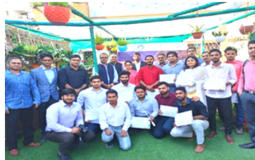
In 2020, Techathon with IIM Calcutta Innovation Park and Govt of India: EAI with BEA organized the Techathon under TIDE 2.0 Scheme, MeitY, Govt of India with IIM Calcutta Innovation Park.