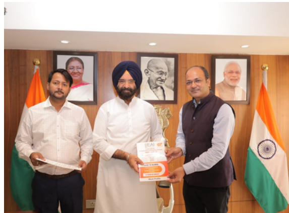
Meeting with Hon Union Minister of Industries, Food & Supplies, and Environment, Forest & Wildlife, Govt of NCT of Delhi, Shri Sardar Manjinder Singh Sirsa