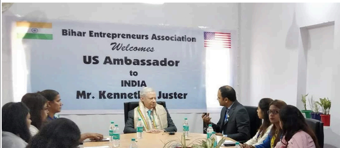
US Ambassador visit to BEA office followed by several consulate visits