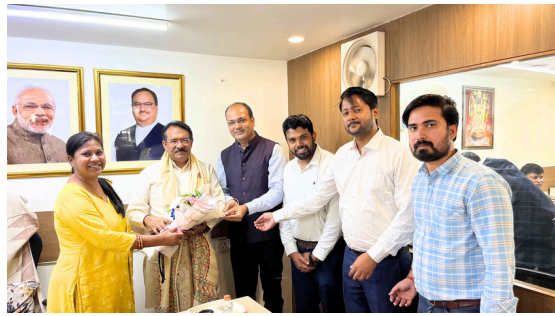
Meeting with Hon Union Minister of State, Corporate Affairs & Road Transport, Govt. of India, Shri Harsh Malhotra