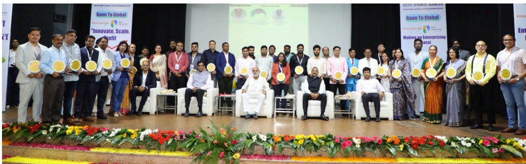
Bharat Entrepreneurship Summit 2024, New Delhi

It was of Integration of all Indian states from Kerela to Kashmir and from Gujarat to Arunachal Pradesh for Business Growth, it had State level Awards, StartUp Awards, Business Discussions and Partnerships.