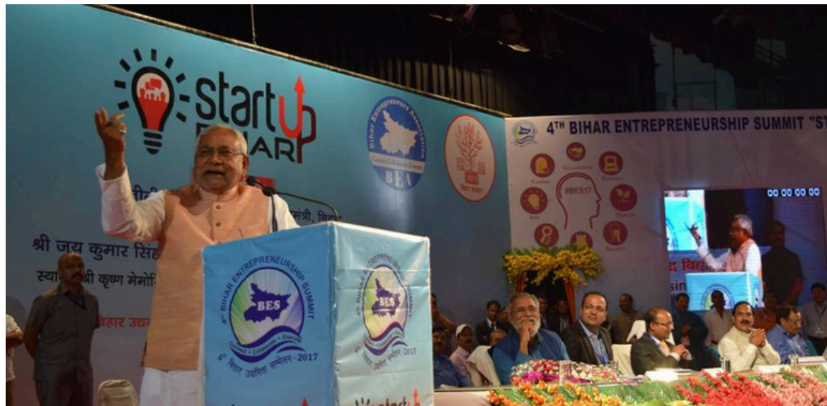
Hon Chief Minister Shri Nitish Kumar praising works of BEA and launching the Bihar StartUp Policy at the 4th Bihar Entrepreneurship Summit.