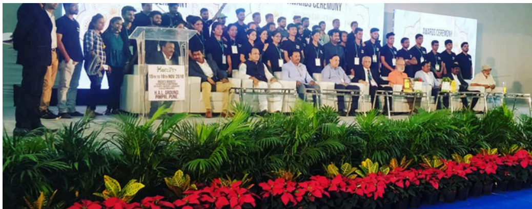
2nd National Agripreneurship Summit, Pune was organized in 2018 with 400 plus exhibitors and 50000 plus entrepreneurs in agri sector coming in a 4 day event.