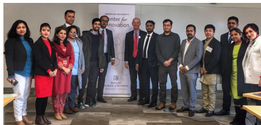
Meeting of the US Chapter members in San Francisco, California, USA