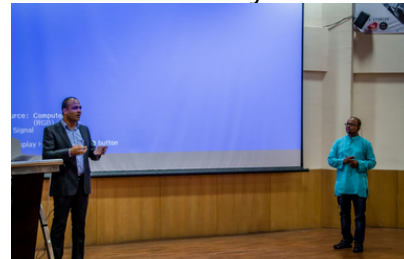
StartUp Yatra workshop in IIT Roorkee with the startups and aspiring entrepreneurs on business modelling