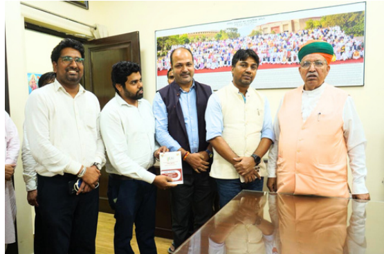
Meeting with Hon Union Minister of Law & Justice, Govt. of India, Shri Arjun Ram Meghwal