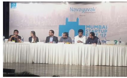
Mumbai StartUp Fest at Bandra Auditorium, Mumbai in 2017