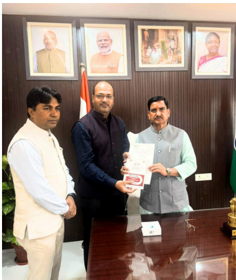
Meeting with Hon Union Minister of State, Housing and Urban Affairs, Govt. of India, Shri Tokhan Sahu