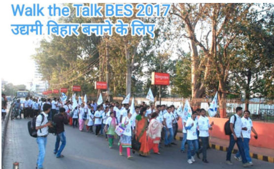
Roadshow: Walk The Talk on Udyami Bharat: Making an Enterprising India, 2017