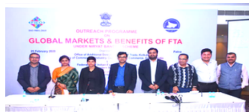
Global Markets & Benefits of FTA - Global Markets and Free Trade under the Govt Scheme was organized. The session was held on the benefits of Free Trade Agreements (FTAs) on global markets. Export Organization of India – Federation of Regions (FIEO-ER) in partnership with BEA under the Ministry of Commerce & Industry, Department of Commerce, Govt of India organized this conference.