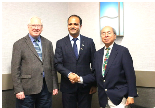
Secretary General of BEA receiving the US Govt IVLP Fellowship Medal in US by US Dept of State officials in 2020.