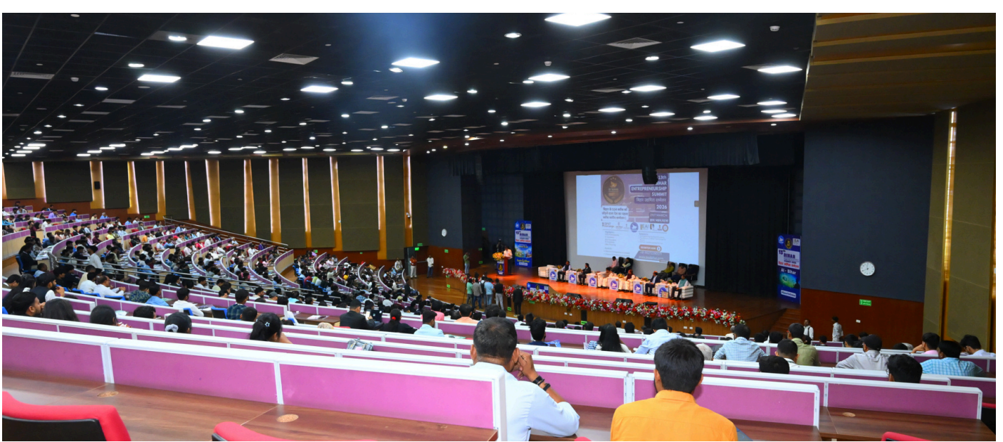
13 th Bihar Entrepreneurship Summit बिहार उद्यमिता सम्मेलन, 21 st March at Gyan Bhawan every year