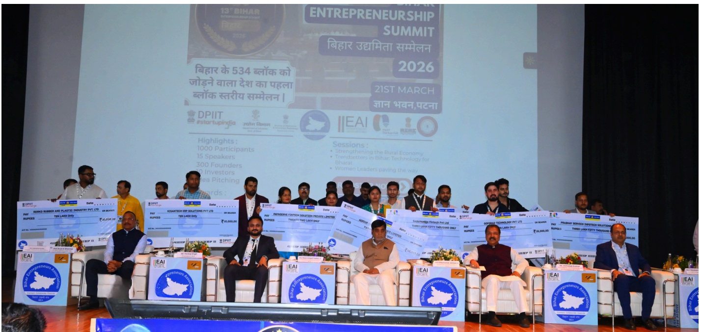
Cheque distribution to startups selected under Govt of India scheme at 13 th Bihar Entrepreneurship Summit बिहार उद्यमिता सम्मेलन