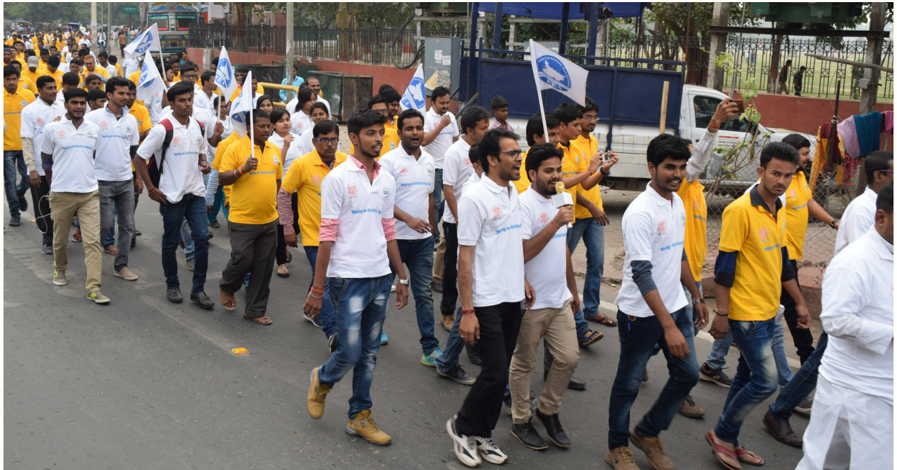
‘Walk the Talk’ initiative at the 4th Bihar Entrepreneurship Summit, 2017.