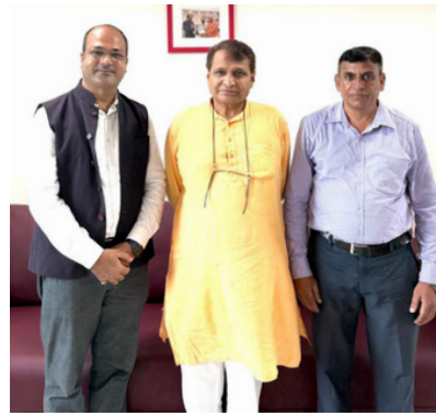
Meeting with Former Hon Union Minister, Govt. of India, Shri Suresh Prabhu