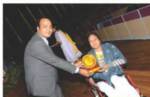
YES 2017-Impact Entrepreneur Award given in differently able category