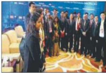
Indian delegates, including BEA office-bearers, with Guizhou province governor Sun Zhigang.