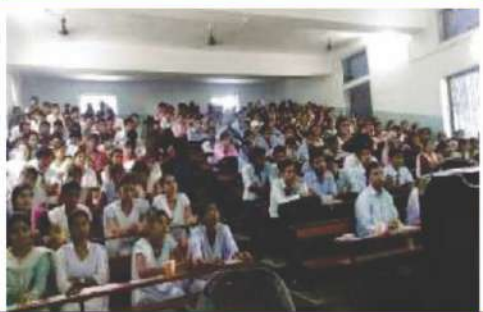
Yuva Yatra at Darbhanga College of Engineering