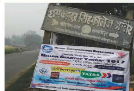
Startup Yatra at RBS College, Samastipur.