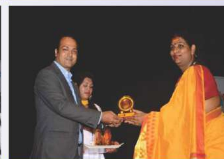
YES 2017-Impact Entrepreneur Award given in Transgender category