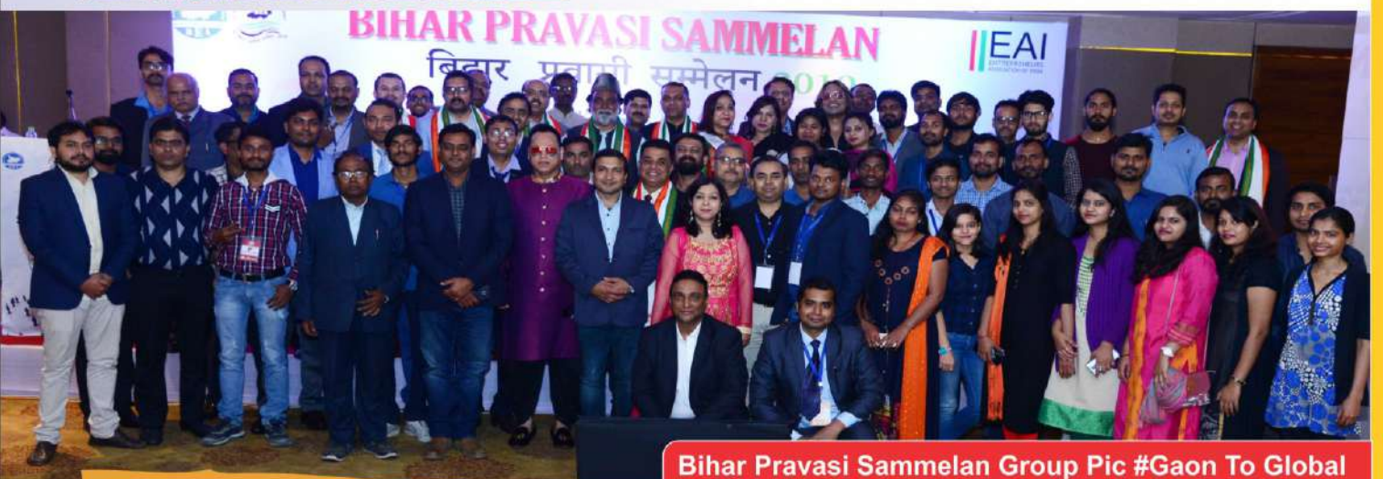
Bihar Pravasi Sammelan Group Pic #Gaon To Global