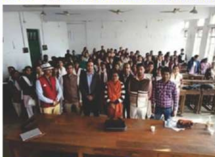
Yuva Yatra at Darbhanga College of Engineering