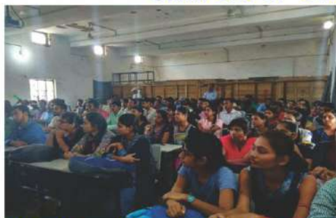
Startup Yatra at M.D.D.M. College Muzaffarpur