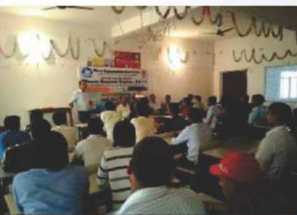
Startup yatra at R.M College Saharsa.