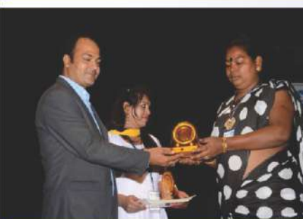
YES 2017-Impact Entrepreneur Award given in Transgender category