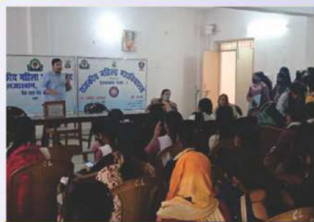
Yatra at Rakiya Kanya Mahavidyalay, Gulzarbagh