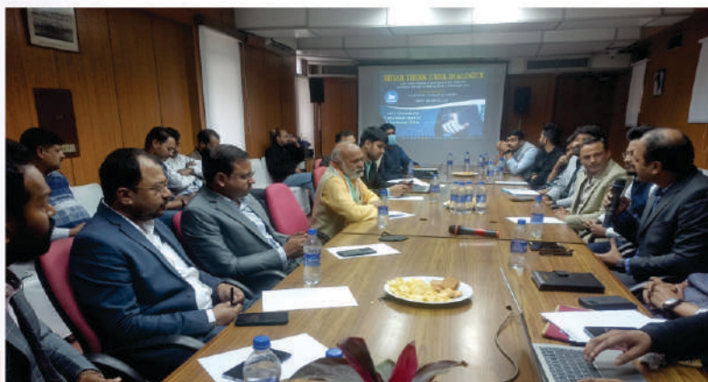
Bihar Think Tank Dialogue organised at Rajendra Bhawan, New Delhi in Feb 2022