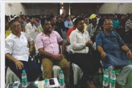
Startup Yatra at Katihar.