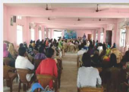
Startup Yatra at Z A Islamia, College, Siwan