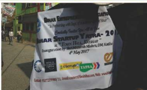
Startup Yatra at Katihar.