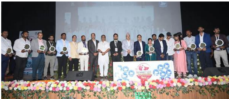
Entrepreneurs from across Bihar receiving "Entrepreneur Award" at BEA's 12 th Bihar Entrepreneurs Summit 2025

BEA's team worked relentlessly for months, reaching all 534 blocks of Bihar to make this possible. Every single entrepreneur who from each block received a certificate of appreciation, acknowledging their hustle and efforts on the ground. Their stories weren't just heard - they were celebrated. The crowd stayed deeply engaged, making notes, raising valid concerns, and networking throughout. The energy in the room spoke for itself. For many, this wasn't just an event it felt like the start of something bigger. It brought forward raw, real startup talent from places that are often overlooked. And for once, they didn't feel left behind. They felt seen, heard, and motivated to grow right where they are.