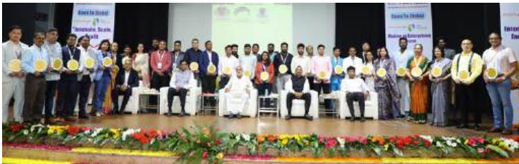
Bharat Entrepreneurship Summit 2024, New Delhi

It was of Integration of all Indian states from Kerela to Kashmir and from Gujarat to Arunachal Pradesh for Business Growth, it had State level Awards, StartUp Awards, Business Discussions and Partnerships.