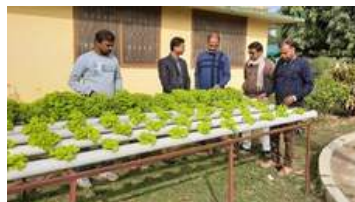
Hydroponics presentation at Krishi Samwad

Krishi Samwad in Katihar , the team of BEA went to Krishi Vigyan Kendra, Katihar . Several issues of Progressive Farmer, FPO, Agri-startup were discussed. New technologies for Makhana crops harvesting were discussed.