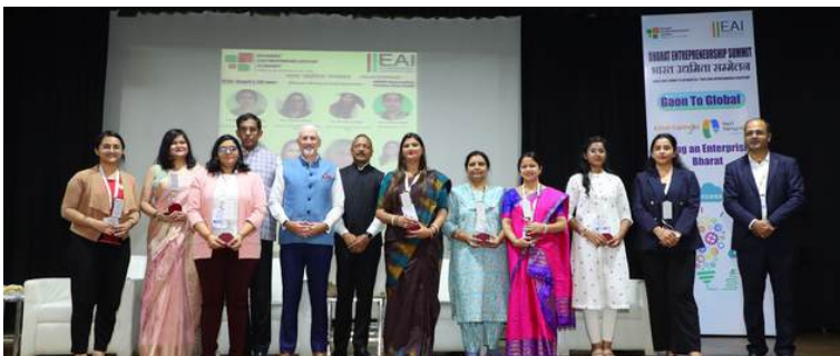
Women Entrepreneur from across India received the Bharat Entrepreneur Award at Bharat Entrepreneurship Summit, New Delhi